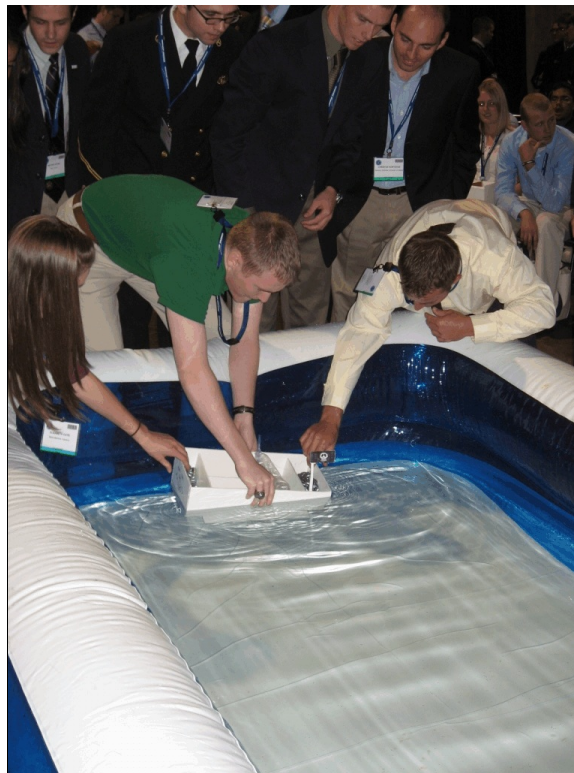
005-Students wait for their vessel to stabilize after having the hull breached by the judges and adding chain-link “cargo.”