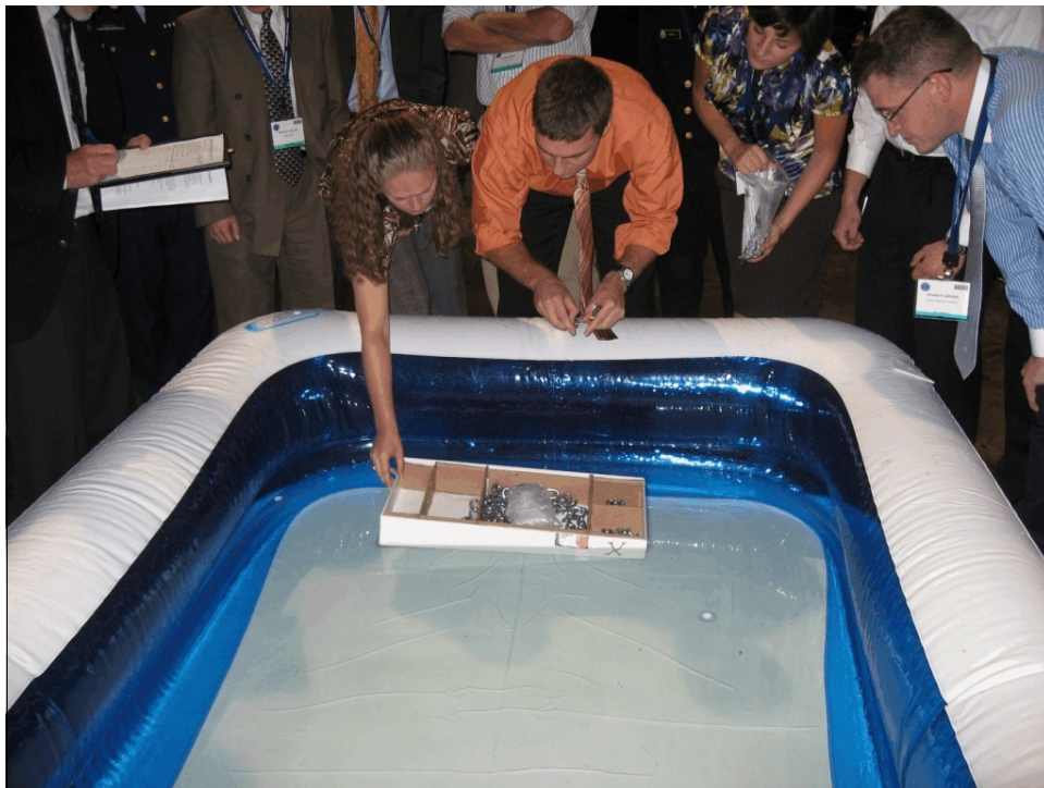
018 - Students adding more chain-link “cargo” after the second hull breach by the judges.