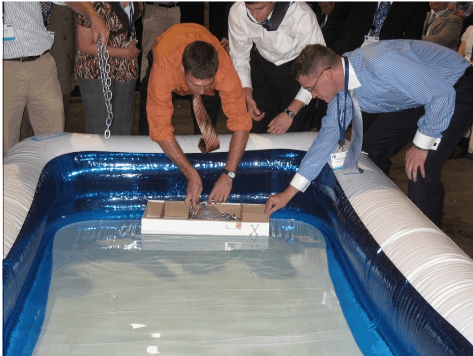
017- Students adding chain-link “cargo” to their vessel.