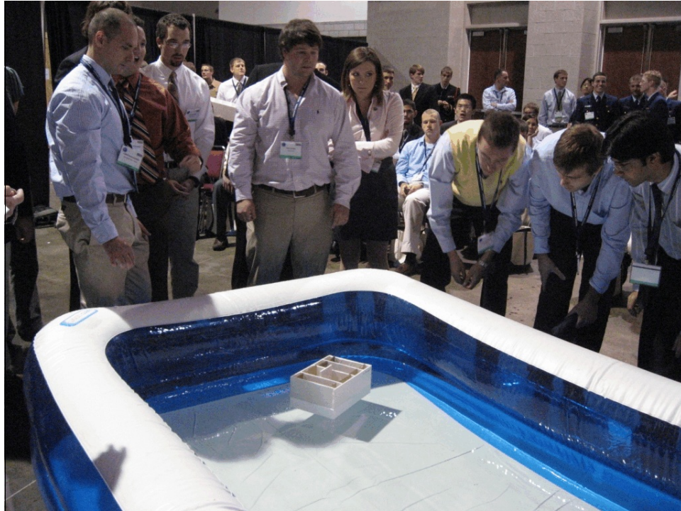
001-Students inspecting their vessel to confirm design draft marks.